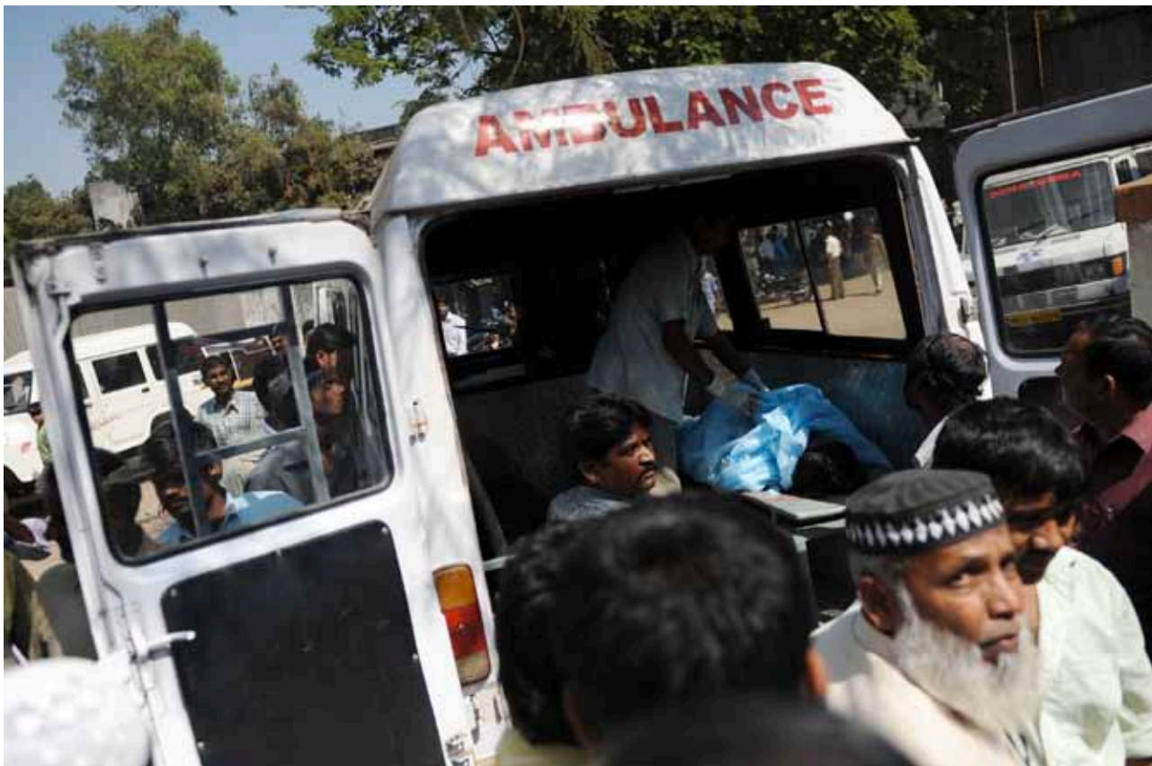
Puné, India: The dead body of a blast victim lies inside an ambulance outside a hospital in Puné on February 14, 2010. A bomb ripped through the German Bakery restaurant, a destination popular with tourists, late on February 13, killing nine people.

completed its plan for the construction of a Material Protection, Control, and Accountability (MPC&A) training center, to be built with support from the U.S. Department of Energy at the Institute of Nuclear Physics near Almaty. In October, Kazakhstan reiterated its intent to establish an additional “Center to Combat the Illegal Use of Nuclear Materials” in Kurchatov to train Kazakhstani rapid response units to combat nuclear terrorism.